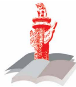
National Publication Foundation